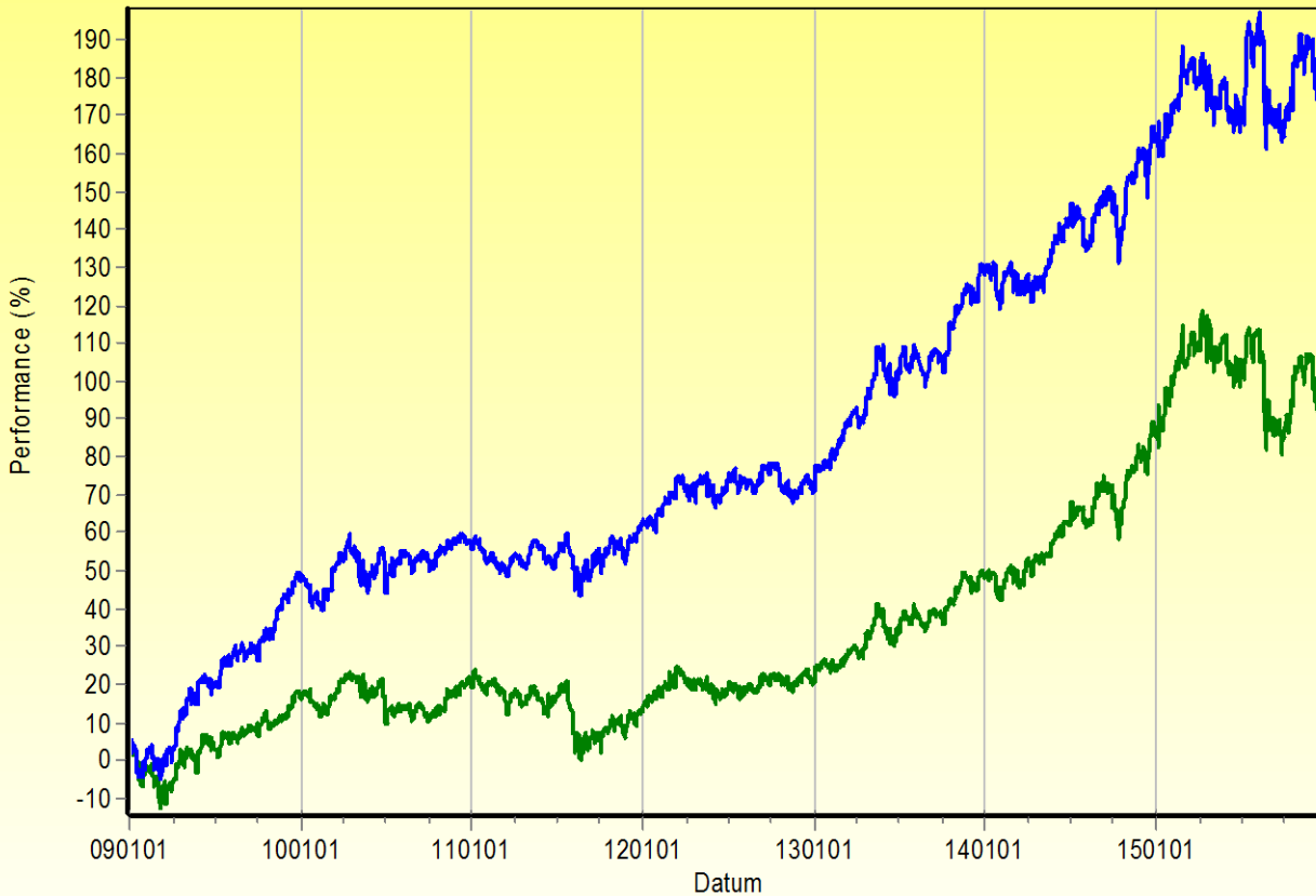
Acc GIPS & Net Worth